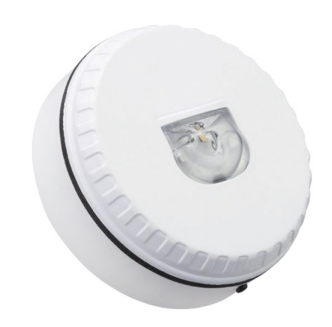
Solista LX Wall White